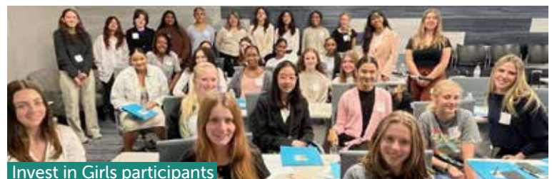
Invest in Girls participants